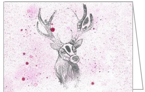
Last Year's Winning Entry

The deadline for entries will be Friday 24 th November in order for us to select and print the designs.